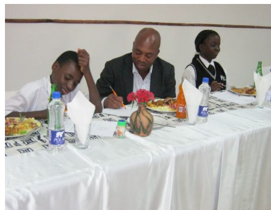
A snapshot from the Orientation.

Thank you to The Kucetekela Foundation for organizing such a wonderful event