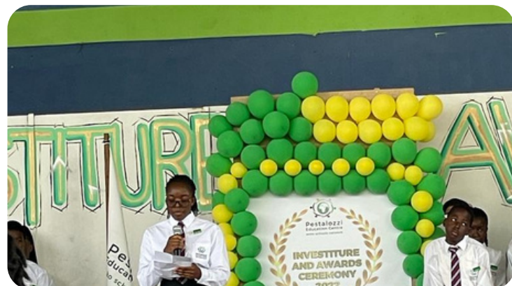
BUPE (KF SCHOLAR) - NEW PESTALOZZI HEAD GIRL