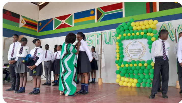
BUPE RECEIVING PIN AND AWARD