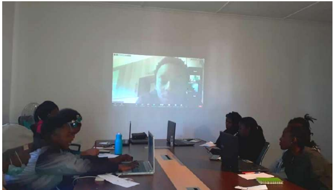
KF Alumni meet to brainstorm Covid-19 response initiative