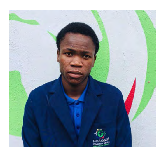
My Experience with Education USA

All in all, the benefits outweigh the challenges.. It was a great experience that I have ever had in my life. I am looking forward to knowing more about technology operations and have developed an interest in IT.