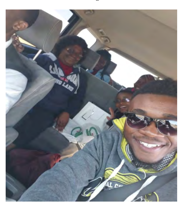
KF Executive Director poses for a selfie with gap year alumni after completing a recruitment visit.