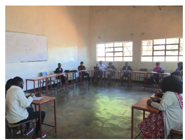
KF Alumni committee heads attending KFAEF September monthly meeting