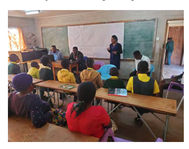
KF Alumni conducting recruitment interviews at Kalingalinga Primary School

Altogether, I am optimistic each alumni that took part in the recruitment saw a new light in their lives. We completed the process on a high. I was the lucky one to have seen it to its very end as we picked the new grade eights for KF!