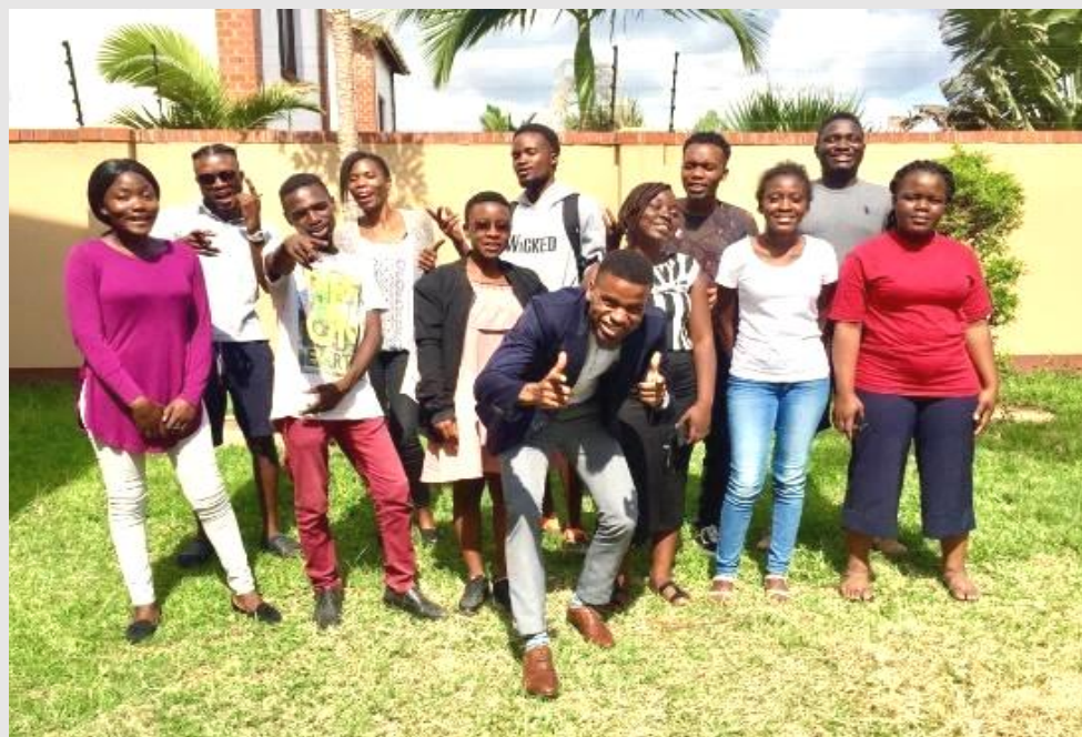
Alumni students posing for a photo after the Forex trading class

I have and will always see forex, as a tool that can be used to attain financial freedom. It is something that I have come to learn, and I am glad to have had conducted an interactive session with a few alumni who had shown interest. Last year in December, from the 22nd to the 25th, I had the opportunity to conduct an info session about forex with some KF alumni. We covered topics from what forex is to how people can make money and learn the skill. We also touched on the risks that one has to take as a forex trader. At first, it was confusing for most people to fully grasp the forex concept, but once we got to the practical side, it made things easier.