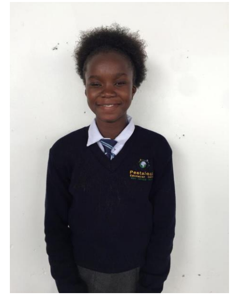
As a new student at Pestalozzi, I looked forward to so many interesting activities; one of them was art, which has always been one of my favorite activities. Last year in term three I participated in an international arts competition that included a number of schools from various parts of the country.

My school had three participants, and I'm glad to mention that I scored 2nd place in the competition. I was more than pleased to be nominated as one of the students to compete in this activity. At first I wasn't so sure if I would make it because I looked at the multitude of students with great artistic skills. With the encouragements from the school and other students, I managed to represent the school very well. This was a great start for me and I have the confidence of bringing more trophies to my school.