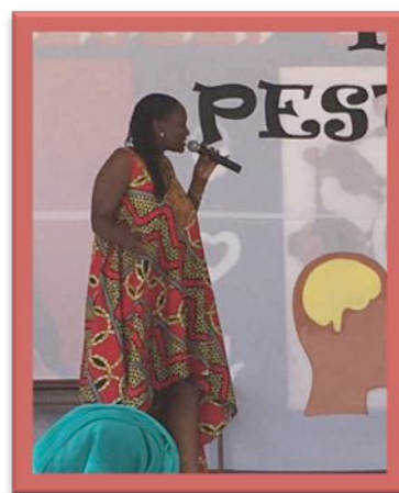
Zambian singer Maureen Lilanda performing at the showcase